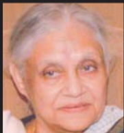
Smt. Sheila Dikshit, Chief Minister, Delhi

"Within a short span, JIMS has carved a niche for itself and established itself as a premier institute. I wish them all luck and success."