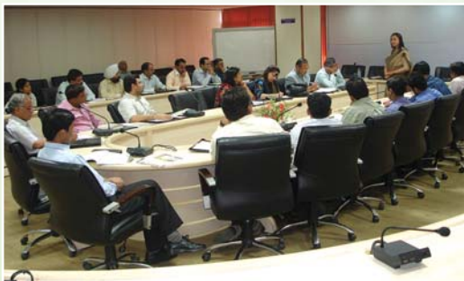
Faculty Development Programme in Session

*Course structure may be revised to accommodate changing global trends/industry demands