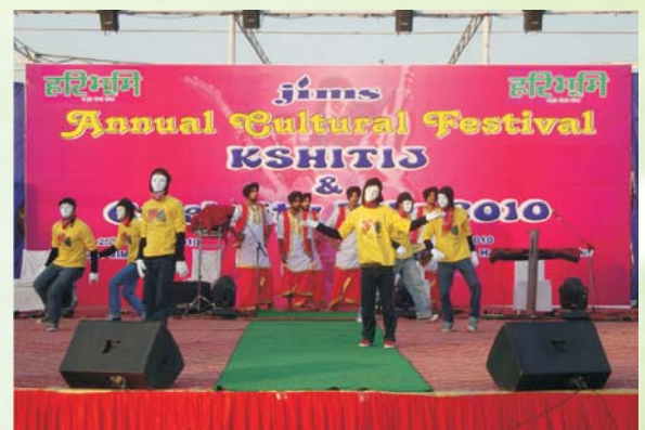
Kshitij Cultural Festival