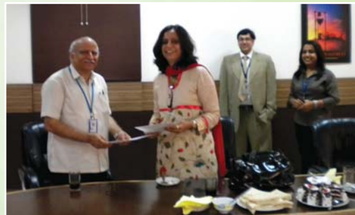
MOU with ICICI on Training Tie-up