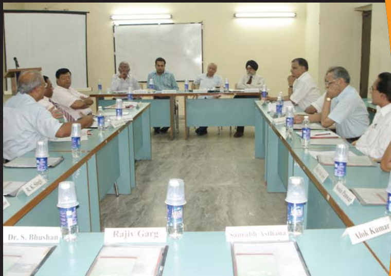
Industry Experts and Academicians review course curriculum

Our proven track record of running professional "Institutes of excellence" for a decade and half in Delhi, NCR and Jaipur has helped us to design and introduce a PGDM programme that is considered at par with other management programmes being conducted by prestigious colleges in India and abroad.