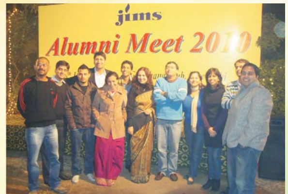
Alumni Meet, 2010